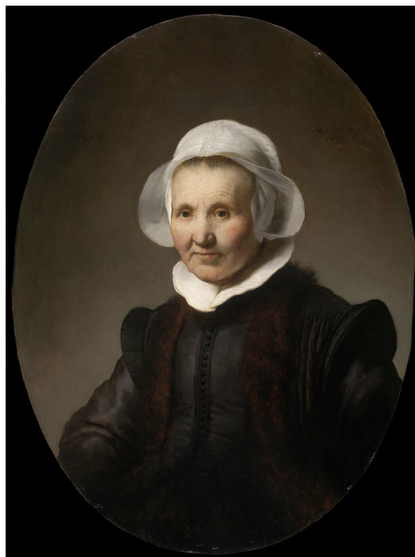
Figure 1. Rembrandt Harmensz. van Rijn, Portrait of Aetje Uylenburgh, 1632. Oil on panel. Promised gift of Rose-Marie and Eijk van Otterloo, in support of the Center for Netherlandish Art, Museum of Fine Arts, Boston.

collaboration with the Museum's curators and conservators; and convene periodic conferences, seminars and lectures that will be open to the academic community and the general public. Utilizing the strengths of the MFA, the CNA will present public programs that encourage visitors to discover connections and relevance in Netherlandish art and culture. In addition, a robust program of loans and traveling exhibitions will enable the MFA to share its collection of Dutch and Flemish art with museums and academic institutions in the U.S. and around the world.