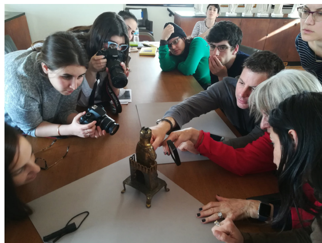
Figure 1. The Prashker Seminar at the Cloisters, New York, January 2018.