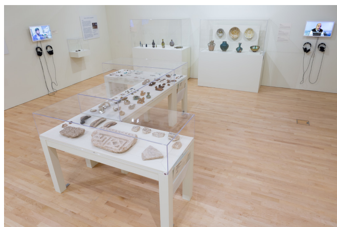
Fragments from the sites of Sijilmasa (Morocco), Tadmekka (Mali), and Gao (Mali) in the exhibition Caravans of Gold.

Sarah Guérin spoke about a complex relay trade in the thirteenth century that sent ivory from sub-Saharan Africa to Northern Europe. Guérin discussed how, over the course of the thirteenth and fourteenth centuries, medieval craftsmen developed an approach to carving that was tailored to this luxury material. She also spoke of the movement