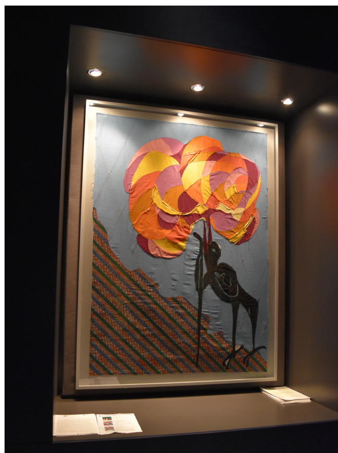
Figure 2. Yinka Shonibare, Creatures of the Mappa Mundi, Cicone Gentes , 2018, installation at Hereford Cathedral.

It is at the entrance to the next room, the Mappa Mundi Gallery, that the thesis of the exhibition began to take focus. Just outside the doors to the climate controlled room was a small display that explained the making of the textiles, and which emphasized that questions of place and materiality are central to understanding the Creatures of the Mappa Mundi . The textiles themselves were made in collaboration between Shonibare and groups local to Hereford: students from Hereford College of Arts, Echo, a charity for disabled people, working with Rose Tinted Rags, and Hereford Courtyard's Creative Ageing project. The display explains that the technique for making the textiles was inspired by the African-American tradition of story quilts, in which scraps of fabric, in this case from Shonibare's own studio that he purchased at Brixton Market in London, were used to make intricate quilts that visually documented the histories of their markers. The Hereford craftspeople were trained by Shonibare, and as they worked they discussed issues of xenophobia and environmental protection, embedding conversations into the objects that themselves are Hereford-made, with materials from London representing Indonesian and African traditions, through techniques intricately linked with the diasporic consequences of the transatlantic slave trade.