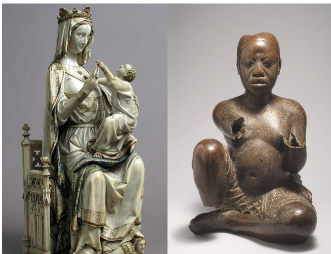
Left: Virgin and Child, ca. 1275–1300, France, Ivory with paint, Metropolitan Museum of Art, Gift of J. Pierpont Morgan, 1917, 17.190.295; Right: Seated Figure, Possibly Ife, Tada, Nigeria, Late 13th–14th century, Copper with traces of arsenic, lead, and tin, Nigerian National Commission for Museums and Monuments, 79.R18.

of copper from sources in Europe and in the Sahara to sub-Saharan Africa, where it was cast into sophisticated sculptures.