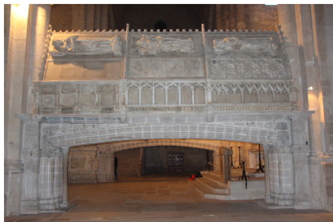
Figure 3. Jaume Cascalls, The Royal Tomb of the Kings of Aragon, Abbey of Santa Maria de Poblet, Catalonia, Spain, Middle of the 14th century-1378.

How did it find its way to the Lipchitz Collection and from there to the Israel Museum? The luxurious pantheon of the royal family was destroyed and looted in 1835 by a crowd who expected to find treasures and jewelry in the coffins. It was finally restored in the mid-twentieth century, and the only original parts saved were some of the statues of mourners that decorated the sides of sarcophagi. The provenance and artistic qualities of the small statue in the museum deserve proper recognition, notes Zur; other figurines looted from the royal pantheon are currently exhibited in the Buddhist Museum in Berlin, the Louvre in Paris, and the Metropolitan in New York.