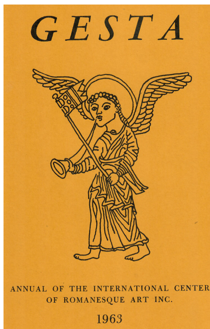
Cover of 1976 Reprint of the Pre-Serial Issue, 1963.