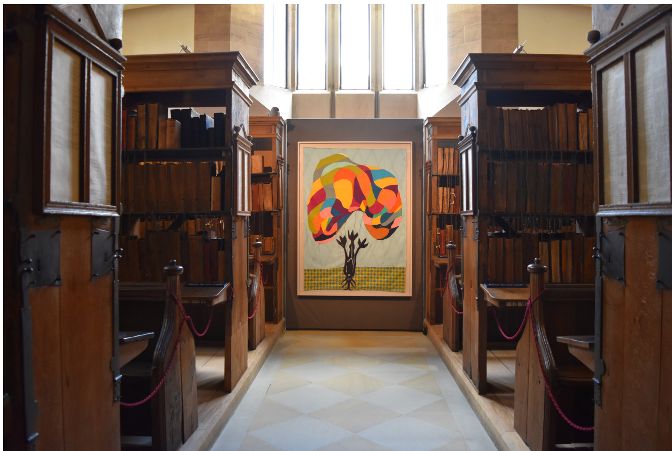
Figure 1. Yinka Shonibare, Creatures of the Mappa Mundi, Mandragora, 2018 , installation at Hereford Cathedral.

In their installation, curated by Anne de Charmant of Meadow Art, the organization that commissioned the project, the textiles were hung along the route to the Mappa Mundi and the Chained Library, in and alongside the Cathedral's permanent exhibition about the history of the medieval library and the making of the map itself. Although