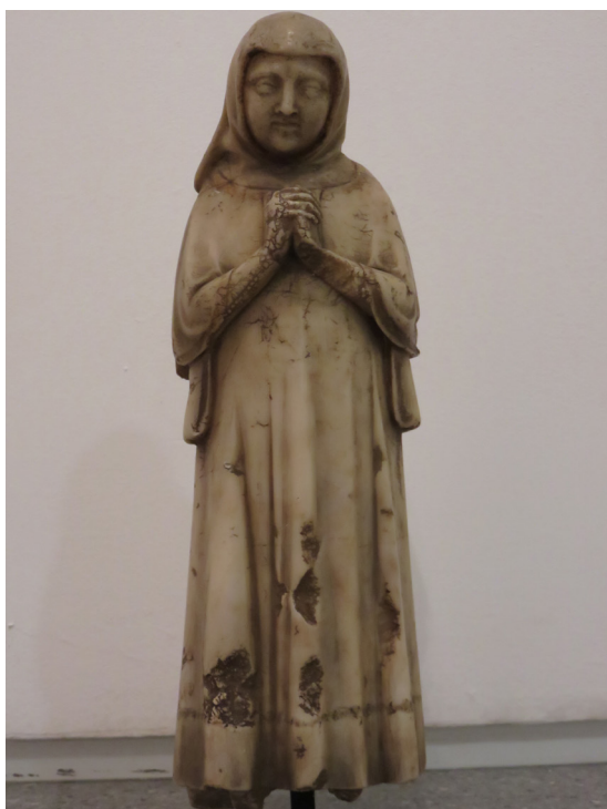
Figure 2. Jaume Cascalls, Mourner / Pleurant, alabaster with traces of gold and paint, The Royal Tomb of the Kings of Aragon, Abbey of Santa Maria de Poblet, Catalonia, Spain, Middle of the 14th century. The Israel Museum.

kings and queens, decorated with statues of funeral processions, including members of diverse social classes who exhibit contemporary mourning practices. Considering the clothing of the small figurine in Jerusalem, labeled “Mourning Monk,” Zur determined that it was not a monk nor a member of the clergy, but represents a relative of the deceased, a citizen, or a member of the court. He explored how the installation to which the mourner belonged echoes lay sermons that were much in debate during that period.