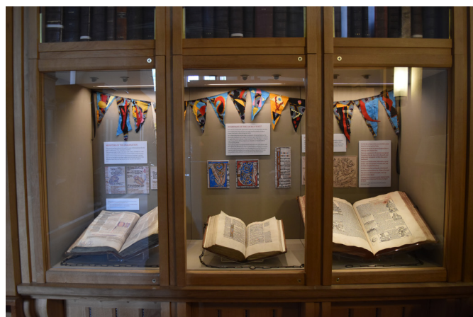
Figure 3. Installation with Dutch-wax bunting in the Chained Library, Hereford Cathedral.

From this display the next room of the exhibition was the Mappa Mundi Gallery itself, where the connections