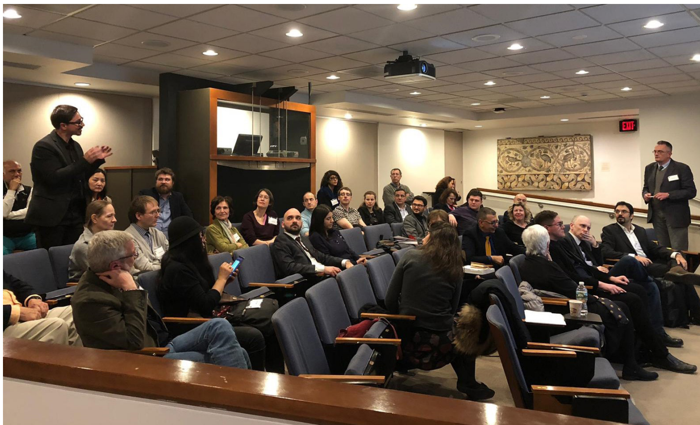
Figure 2. Discussion during the Roundtable Forum at the “Eclecticism at the Edges” Symposium.

event explored the temporal and geographical parameters of the study of medieval art, architecture, and visual culture, seeking to challenge the ways in which we think about the artistic production of Eastern Europe from the fourteenth through the sixteenth centuries. Serbia, Bulgaria, and the Romanian principalities of Wallachia, Moldavia, and Transylvania, among other centers, took on prominent roles in the transmission and appropriation of western medieval, Byzantine, and Slavic artistic traditions, as well as the transformation of the cultural legacy of Byzantium in the later centuries of the empire, and especially in the decades after the fall of Constantinople in 1453.