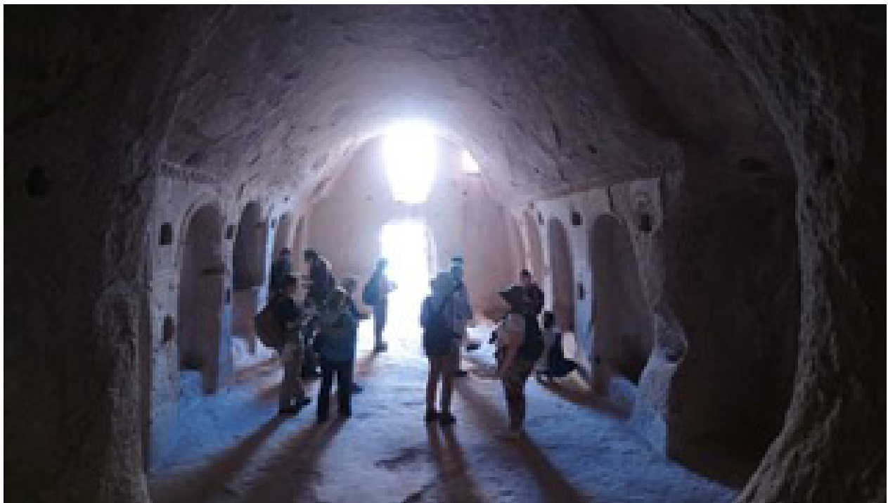
Zelve open air museum, Holy Cross church.