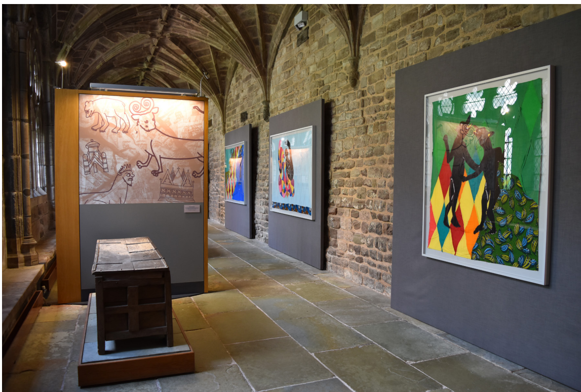
Figure 4. Yinka Shonibare, Creatures of the Mappa Mundi, Gigantes, Monocules, and Alerion and Satyrs , 2018, installation at Hereford Cathedral.

between the medieval map and the contemporary textiles became clear. The map hangs in low light and behind glass, allowing visitors to stand within inches and pore over its details from close proximity. The fifth textile in the exhibition, representing the cicone gentes , or the stork people, was hung on the opposite wall, creating a direct juxtaposition between the map and the textile (Figure 2). Shonibare's works are comparable in size to the Mappa Mundi, and despite their differences in medium, color, and technique, they share an undeniable material quality in the undulation of their surfaces, caused in the textiles by the manner of sewing, and in the map by the wear of time. This is also the moment that the identities of the mysterious beings of Shonibare's textiles are revealed in the map itself: the monoculi of India, the bonnacon of Phrygia, the mandrake of Egypt, for example.