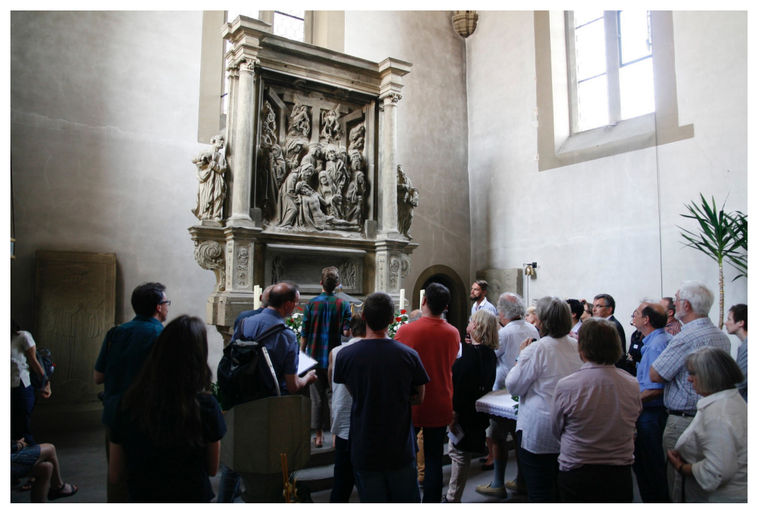
6. Conference participants in front of the Lamentation of Christ in Maidbronn, June 23, 2017.