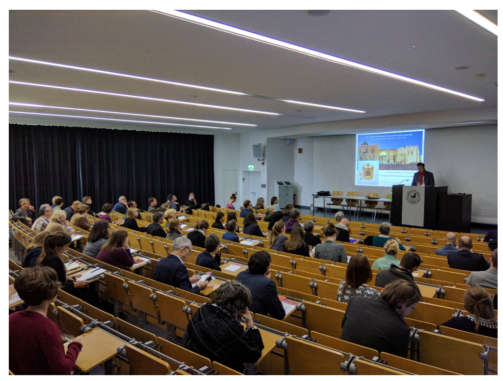
1. ICMA San Isidoro Treasury session at the Freie Universität.