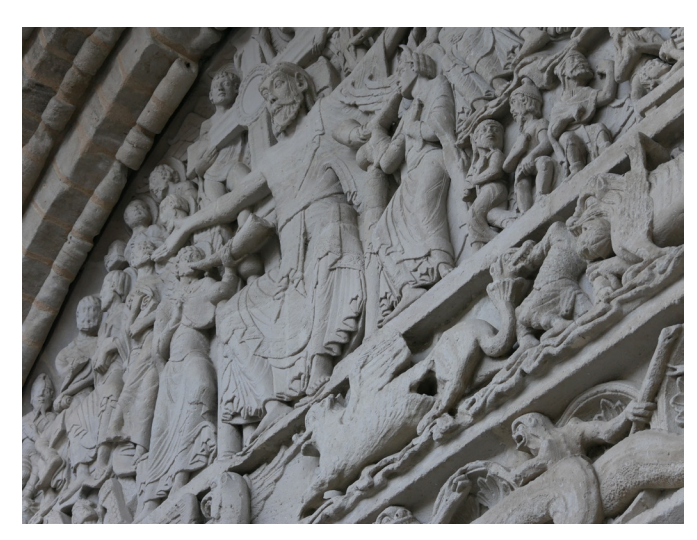
Figure 4. The Christ of the Parousia, at Beaulieu-sur-Dordogne.