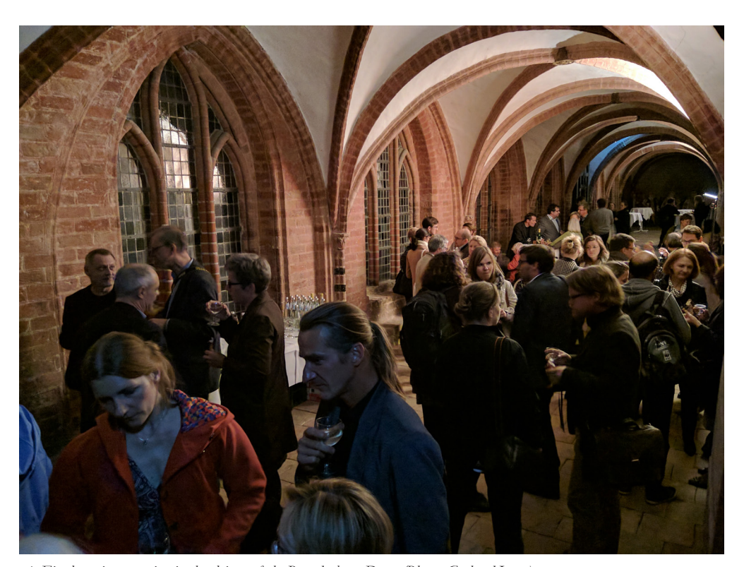
4. Final evening reception in the cloister of the Brandenburg Dom.