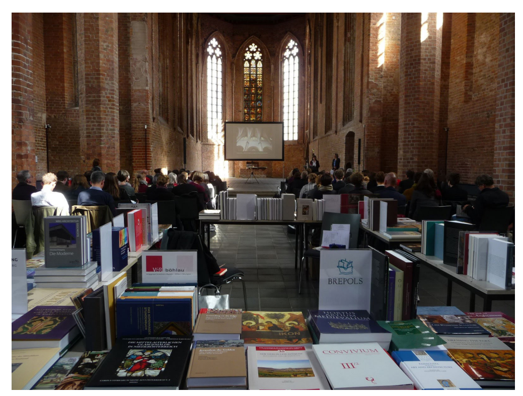
2. Die Welt im mittelalterlichen Kirchenschatz session in the Paulikirche.