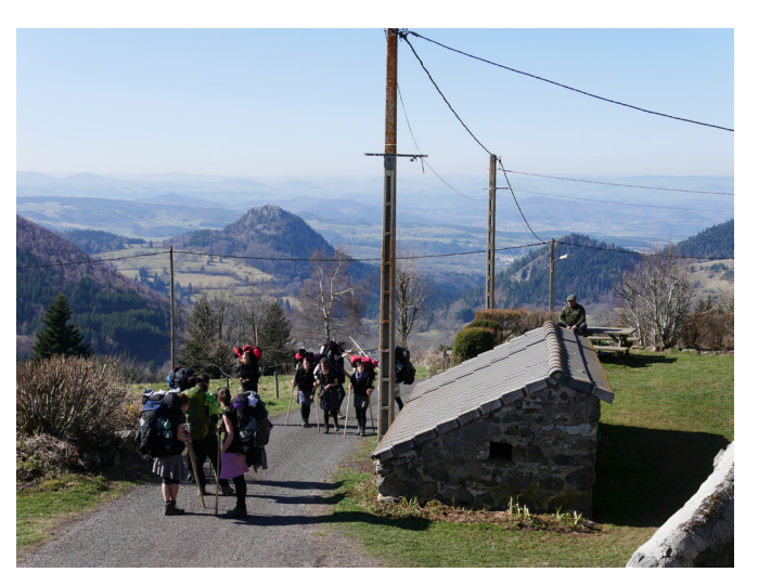
Figure 1. Approaching le Puy-en-Veley.

During the spring semester 2017, a group of eleven students led by professor Ivan Foletti lived through an astonishing experiment in medieval art. From March to June, the group walked through Switzerland and France, following several ancient pilgrimage roads (fig. 1). From Lausanne to Conques, to Saint-Benoît-sur-Loire and to Mont-Saint-Michel, the pilgrim-art-historians walked more than 1500 kilometres, encountering some of the most iconic medieval objects, such as the golden statue-reliquary of Sainte-Foy in Conques, the wooden doors of Le-Puy-en-Velay, the portal and treasure of the basilica of Beaulieu-sur-Dordogne, the abbev-church of Saint-Étienne in Nevers, etc. The periods of walking were alternated with three international workshops (all lectures available online) with such guest speakers as Michele Bacci, Hans Belting, Stefano d'Ovidio, Sible de Blaauw, Francesco Gangemi, Cynthia Hahn, Tanja Michalsky, Éric Palazzo, Martin Treml, and Cécile Voyer.