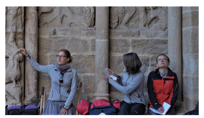
Figure 3. The bench at Beaulieu-sur-Dordogne.

At this stage of our reflexion, one other important aspect has briefly to be mentioned as well. The theatricality of the pilgrim's landscape becomes evident with kilometres of walking. The conceivers of crucial monuments were