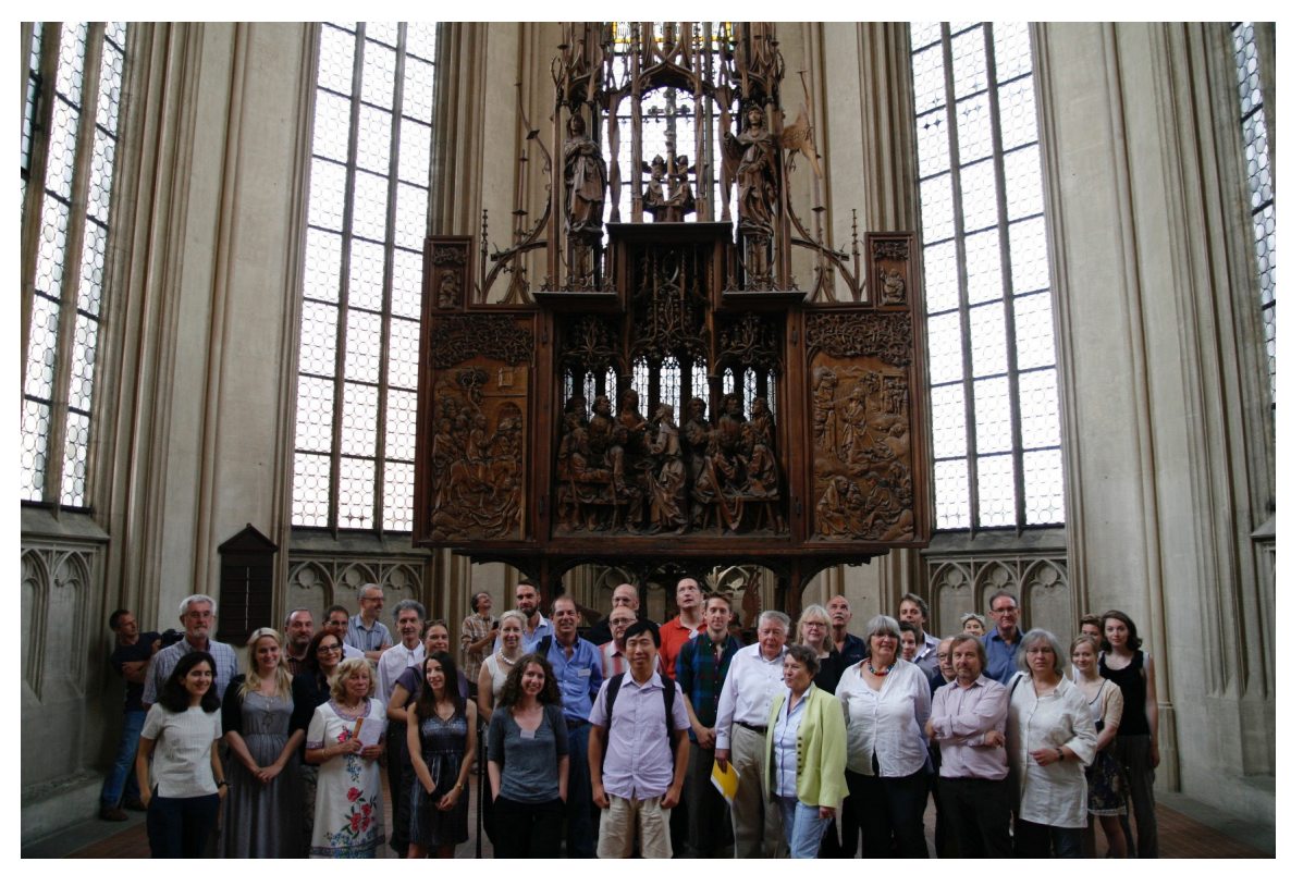
3. Conference participants in the Holy Blood Chapel, Church of St. James in Rothenburg ob der Tauber, June 23, 2017.