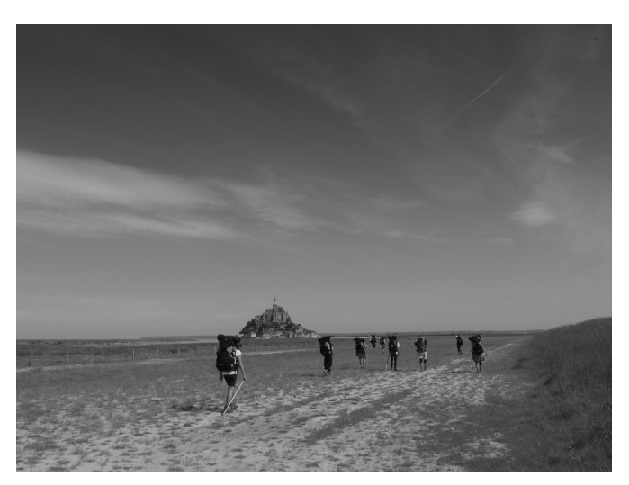
Figure 5. Approaching Mont-Saint-Michel.

The project Migrating Art Historians will now pursue, after the experimental part, with a more rationalised step, in the form of a collective monograph. Therefore, these are only the first reflections, written at the very end of the experience itself. The last element we want to mention is that, apart from the experimental approach and the more theoretical frame, another question became vital during this project: the communication with wider audiences. Since the beginning, we wanted to share our experience of medieval past through the production of eleven short movies presenting various aspects of pilgrimage – a task in which we hopefully succeeded. The movies uploaded to the YouTube channel of the Centre for Early Medieval Studies in Brno are reaching a growing number of viewers. During our pilgrimage, we also had the opportunity to be welcomed by dozens of people and interacting with them convinced us